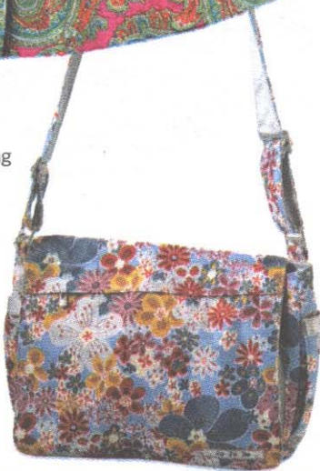
Diaper bag by Ju Ju Be, $125.