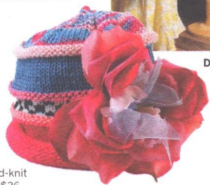
Hand-knit hat, $36.

Details: Daniela Jay, 6525 W. Happy Valley Road, Suite C-103, Glendale. (623) 566-8380. Hours are 10 a.m. to 8 p.m. Mondays through Saturdays.