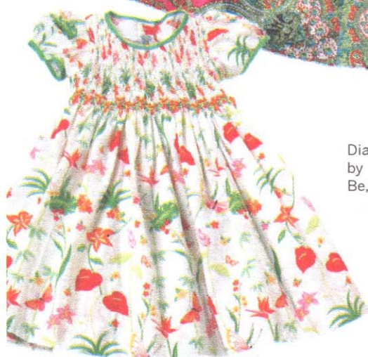
Floral dress by Isabela Collection, $45.